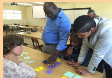
Exploring a FaSMEd activity at Vuyiseka Secondary School